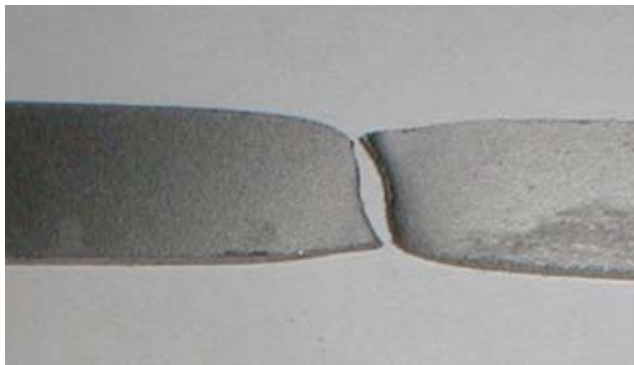
Top: Standard ASTM E8 Tensile Specimen. Gage marks spaced at 2 inches are applied with a punch. Source: Admet Inc. Bottom: A tensile specimen is pulled to fracture. The region where necking occurs is depicted. Source: Admet Inc.

D uctility is defined as the ability of a material to deform plastically before fracturing. Its measurement is of interest to those conducting metal forming processes, to designers of machines and structures, and to those responsible for assessing the quality of a material as it is being produced.