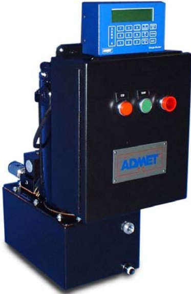
MegaForce II-10K with ADMET's Gauge Buster Indicator.

"for materials testing machines and hydraulic presses requiring automatic control of load or strain rate. . . . A low cost solution of unrivaled performance."