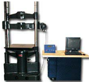
60,000 lb capacity Baldwin Universal Testing Machine retrofitted with MegaForce II and ADMET's MTESTWindows Materials Testing System.

Mechanically, most manually operated hydraulic universal testing machines will never wear out because they are over designed. These machines feature a single acting piston and as such can be retrofitted with MegaForce II and one of ADMET's controllers. The cost of MegaForce II retrofit is 50-70% less than the cost of a conventional servo-hydraulic retrofit.