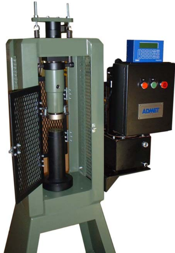
A compression testing machine configured for cement cube testing outfitted with MegaForce II-10K and ADMET's Gauge Buster Indicator.