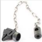
THS341 with M8 coupling