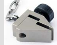
THS341-15 special design clamping surface 15mm wide