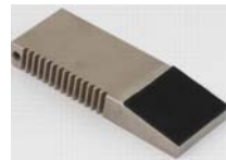
GW-5T-BG Rubber jaws