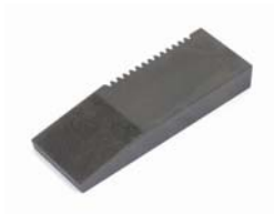
GW-5T-BP Pyramid jaws

* Further jaw types available upon request.