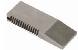
GW-5T-BD Diamond jaws