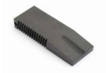
GW-5T-BV For round samples with min 3mm thickness