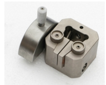
GW-20T+TK Option (for GW-20T and GW-50T)

GW-T-BV V-jaws • For all kinds of round samples • Hardened steel 58 HRC • Tooth pitch 1.2 mm