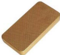
Titanium nitride coating