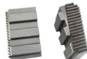
Special jaws for belting