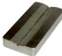
Diamond coated v-jaws